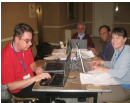
Figure 2. Judges entering scores.