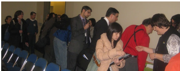
Figure 3. Judges registration.

As the number of participants grew over the years, so did the number of prize sponsors. For the poster session in 1994 the three judges pitched in $50 each toward three prizes of $75, $50 and $25. Starting in 1995 the Council on Undergraduate Research (CUR) began contributing $300 for three prizes at $100 each. By around 2000 there were fifteen $100 prizes, with the AMS, the MAA, and CUR all contributing. Also around that time the AMS and MAA began providing refreshments for all attendees. The number of prizes more than doubled in 2004 with additional sponsorship from the Educational Advancement Foundation. The number reached 37 in 2008, and by 2010 the list of prize sponsors had swelled to include the Center for Undergraduate Research in Mathematics, Educational Advancement Foundation,