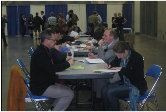
Figure 6. Judges writing comments.

Of course there are many factors that have contributed to popularity of the poster session as a venue for undergraduates to present their research. By the mid to late 1990s the number of REU programs had grown substantially, and the MAA was offering an annual JMM minicourse for faculty and Project NExT an annual four-hour course on how to involve undergraduates in research.