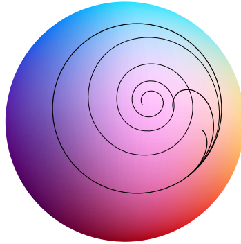
Figure 3. Curves of constant torsion approaching a circle.

The editor pointed out that if we consider those solutions to (5) with C = 0 , and k(s_0) = \csc(s_0\tau) > 1 , then the corresponding curves approach a “small circle” on S^2(1) of constant curvature k(s_0) . This is an interesting example of nonuniform convergence. The curves as a whole converge pointwise to an infinitely covered great circle, while it is still possible to find sequences of “tails” that converge to infinitely covered small circles. This phenomenon is indicated in Figure 3, where one sees a sequence of curves converging to a small circle. More details of this simple yet interesting behavior will be written up elsewhere.