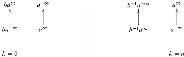
Figure 3. Dynamics graph of i_{a^k} \circ \delta^n for k(n-k) = 0

point in \partial F_2 \setminus \partial \langle a, bab^{-1} \rangle , and let x be the longest prefix of X in \langle a, bab^{-1} \rangle . Then X = xY , with no cancellation between x and Y , and the first letter of Y is equal to b or to b^{-1} . If Y begins by b , then \omega_{\delta^n}(Y) = ba^\infty and \omega_{\delta^{-n}}(Y) = ba^{-\infty} . If Y begins by b^{-1} , then \omega_{\delta^n}(Y) = a^{-\infty} and \omega_{\delta^{-n}}(Y) = a^\infty . Hence \delta^n has 2 isoglossy classes of \omega -limit points (with representatives ba^\infty and a^{-\infty} ), and \delta^{-n} has 2 isoglossy classes of \omega -limit points (with representatives ba^{-\infty} and a^\infty ). The dynamics graph of \delta^n is given in Figure 3.