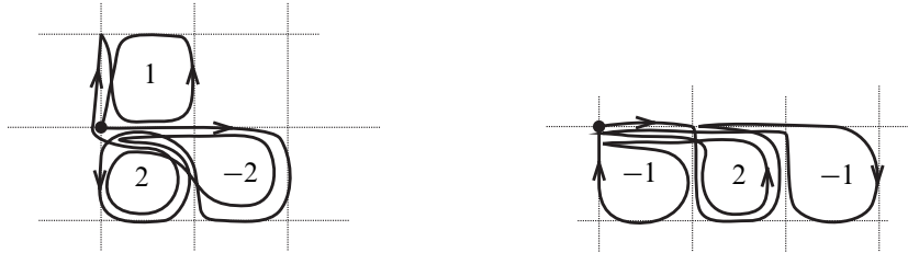
Figure 1: Left, the graphical representation of the curve \gamma_{r_1} which begins in the black dot. The represented curve and the actual curve are homotopic in the plane with the centers of the squares removed. In the interior of the squares we see the corresponding winding numbers. Right, the curve \gamma_{r_2} .

If \mathcal{P} = \langle x, y \mid r_1, r_2, \dots, r_m \rangle and \mathcal{Q} = \langle x, y \mid s_1, s_2, \dots, s_m \rangle are cocommutative presentations such that the normal closure of \{r_1, r_2, \dots, r_m\} coincides with the normal closure of \{s_1, s_2, \dots, s_m\} , then each s_j is a product of conjugates of r_i 's and inverses of r_i 's. By Lemma 3, P_{s_j} is an R -linear combination of the P_{r_i} . Therefore \Lambda(\mathcal{Q})^t = M\Lambda(\mathcal{P})^t for certain M \in R^{m \times m} . Symmetrically, \Lambda(\mathcal{P})^t = M'\Lambda(\mathcal{Q})^t for some M' \in R^{m \times m} .