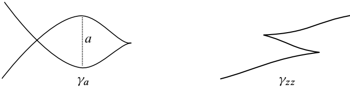
Figure 1: Left: the front picture of the Legendrian arc \gamma_a with a chord of action a . Right: the front picture of a once-stabilized Legendrian arc.

self-intersection and a single cusp. Set