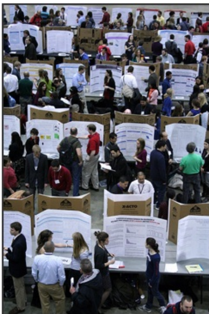
Figure 4. Undergraduate poster session, JMM 2012.

It is no coincidence that the rise in popularity of the poster session mirrors the increase in the number of ways in which the joint meetings became more attractive for undergraduates. When the first poster session was held in 1991, the JMM