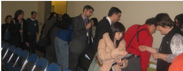
Figure 3. Judges registration.

As the number of participants grew over the years, so did the number of prize sponsors. For the poster session in 1994 the three judges pitched in $50 each toward three prizes of $75, $50 and $25. Starting in 1995 the Council on Undergraduate Research (CUR) began contributing $300 for three prizes at $100 each. By around 2000 there were fifteen $100 prizes, with the AMS, the MAA, and CUR all contributing. Also around that time the AMS and MAA began providing refreshments for all attendees. The number of prizes more than doubled in 2004 with additional sponsorship from the Educational Advancement Foundation. The number reached 37 in 2008, and by 2010 the list of prize sponsors had swelled to include the Center for Undergraduate Research in Mathematics, Educational Advancement Foundation,