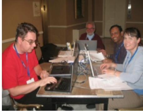
Figure 2. Judges entering scores.