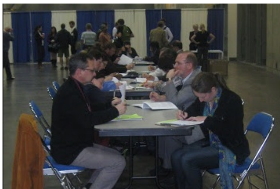
Figure 6. Judges writing comments.

Of course there are many factors that have contributed to popularity of the poster session as a venue for undergraduates to present their research. By the mid to late 1990s the number of REU programs had grown substantially, and the MAA was offering an annual JMM minicourse for faculty and Project NExT an annual four-hour course on how to involve undergraduates in research.